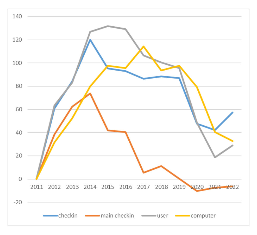
Figure 2. Relative change during the years in main usage statistics of CSC's ArcGIS license server.

Single Use licenses were used for 155 installations in 2022.